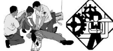
Safety & Health